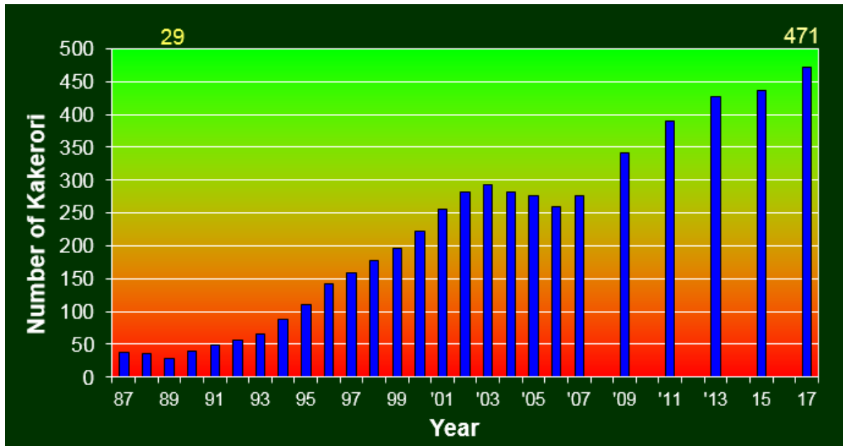
Figure 2. Population change in the kakerori on Rarotonga, showing the minimum of 29 birds in 1989 and the peak of 471 birds found in 2017. The drop in numbers between 2003 and 2006 was the result of translocating 30 birds to Ātiu, plus the impacts of 5 cyclones that passed through the southern Cook Islands in February-March 2005 (Robertson et al 2020).

The global population of kakerori in 2017 across these two sites was therefore approximately 600 birds, a more than a 20-fold increase from their lowest recorded population number of 29 in 1989 (Robertson et al 2020).